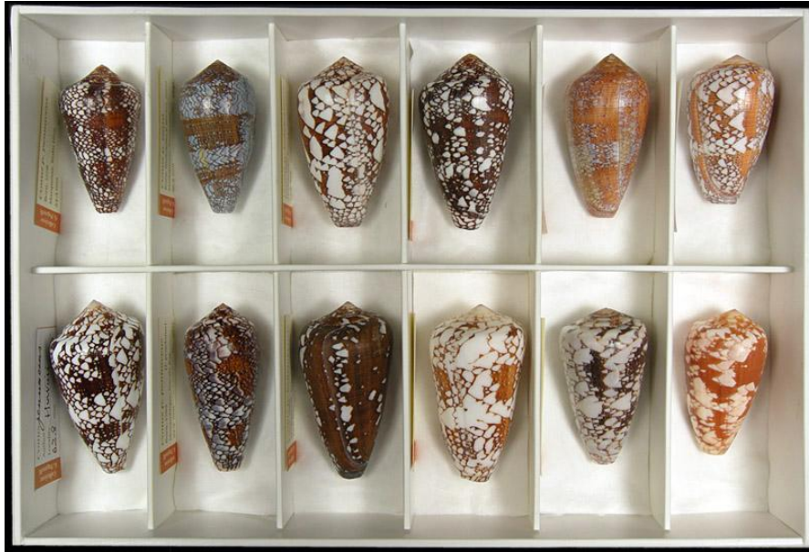
A pennaceus Box